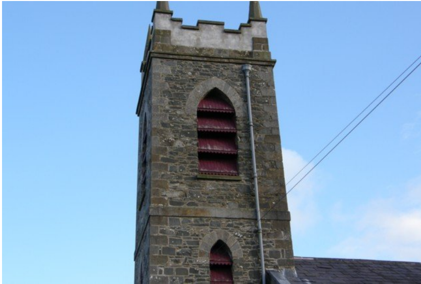
Transmitter Site Photo