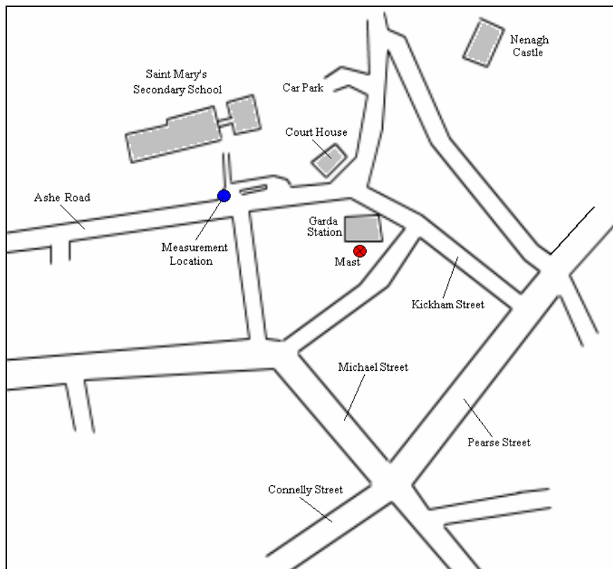
Map 1. Measurement Location