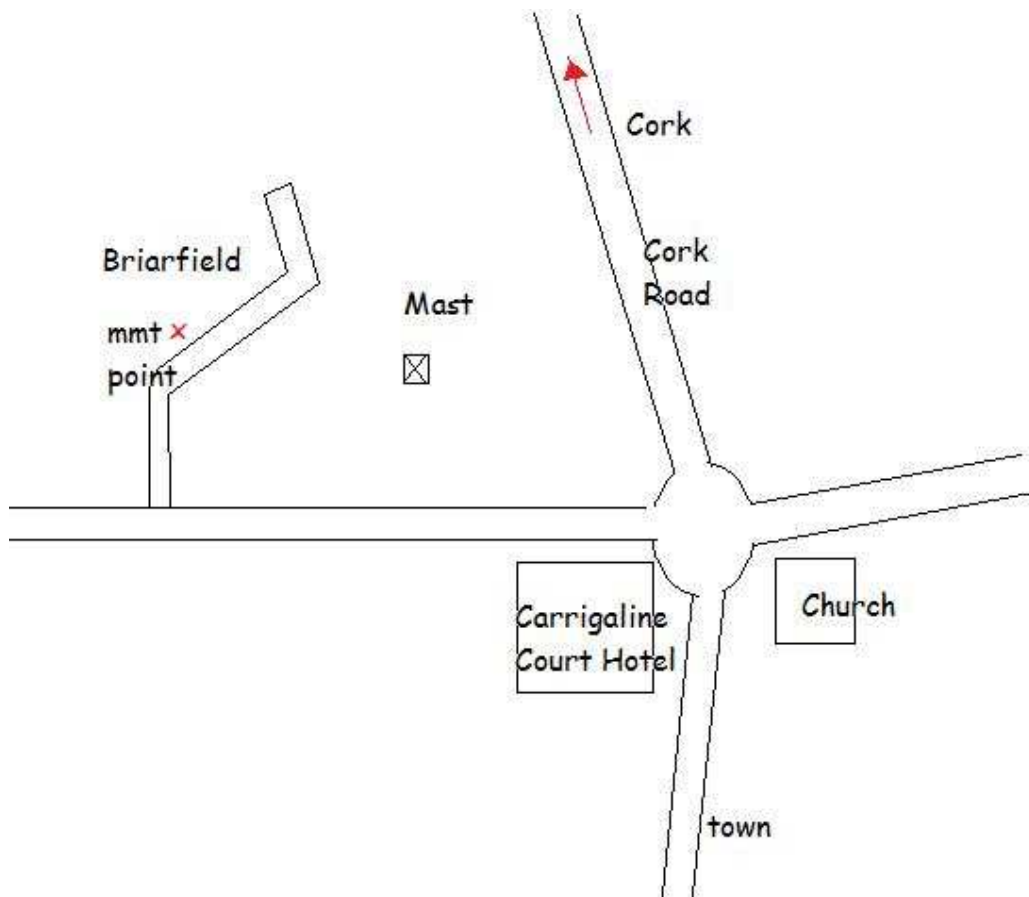
Map 1: Sketch of Measurement Location