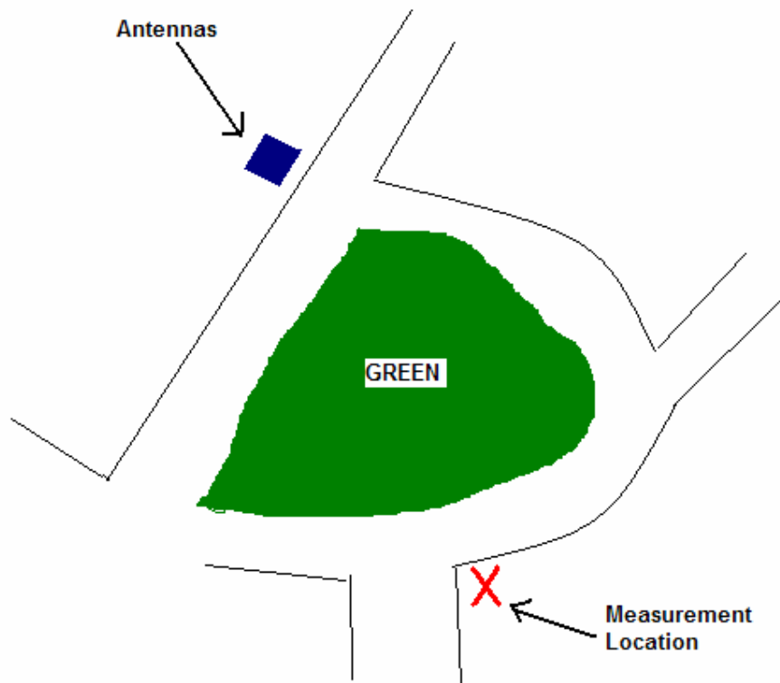
Map 1. Sketch of Measurement Location

Engineers: Fiachra O'Doherty, Ivan Kiely