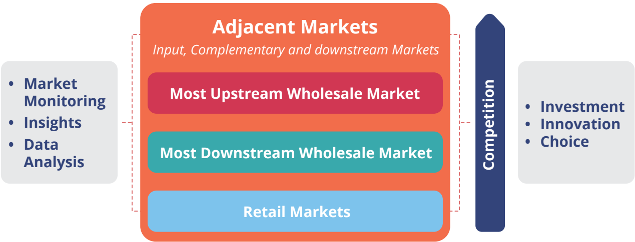
Figure 1: Regulation enables Competition and Investment:

Our guiding principle is that where competition is sustainable, markets deliver optimal outcomes in terms of investment and price, quality, choice and innovation, ultimately to the benefit of consumers.