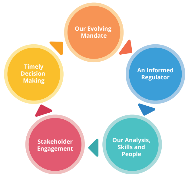
Figure 5: Ensuring Effective and Relevant Regulation

Our organisation is staffed by skilled experts whose work is underpinned by efficient organisational processes and a mandate that meets the needs of the sector.