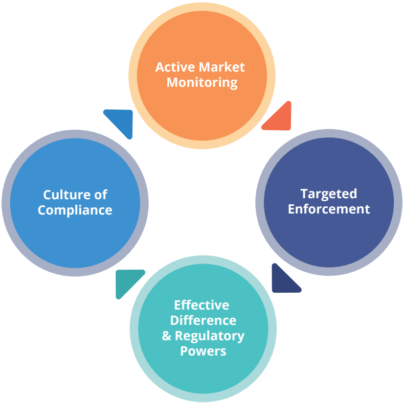
Figure 4: Optimal Enforcement

We continuously monitor the application of regulatory obligations to ensure markets develop properly and seek to take targeted enforcement action in a way that maximises the effectiveness of the regulatory regime.