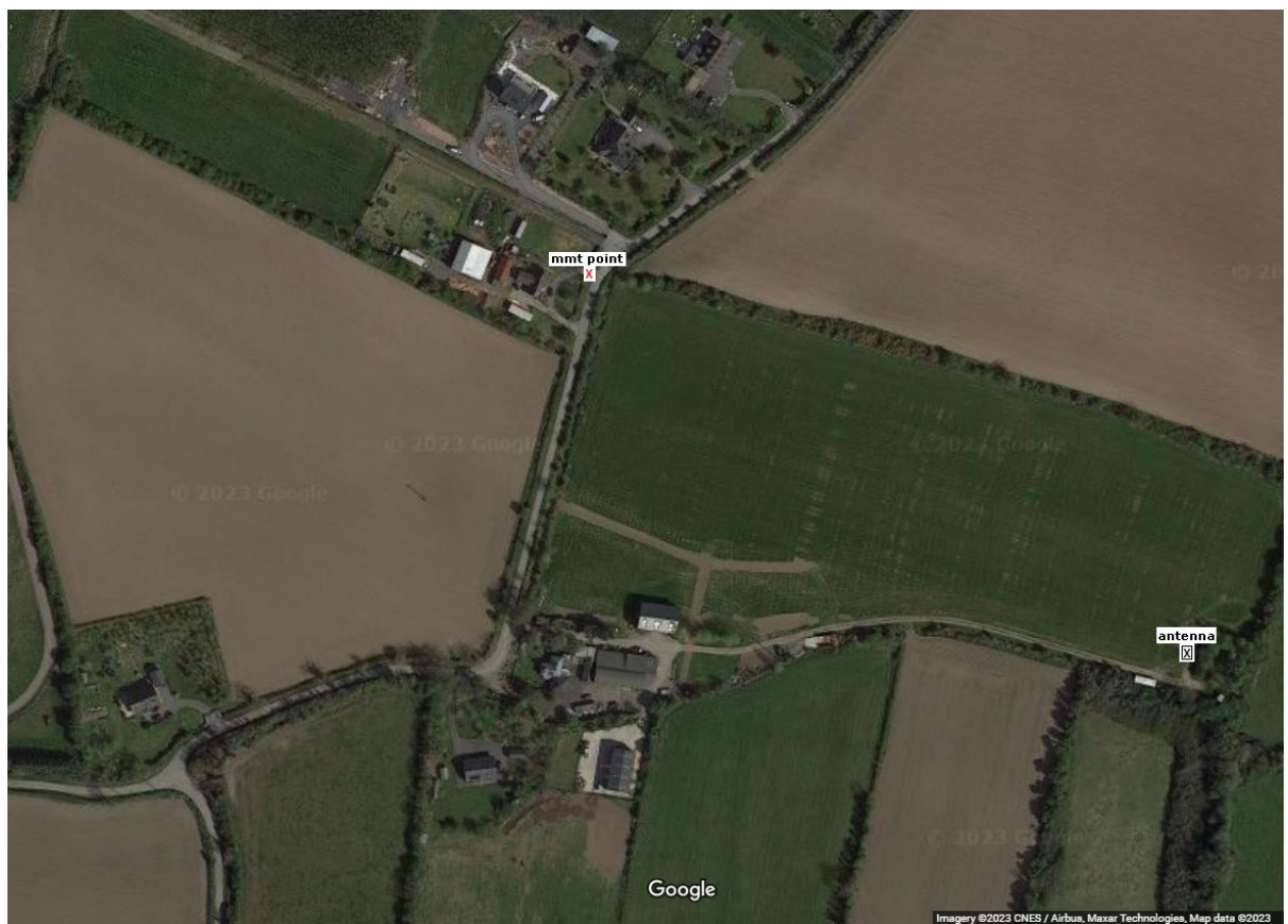
Map of Designated Transmitter Site and Measurement Location