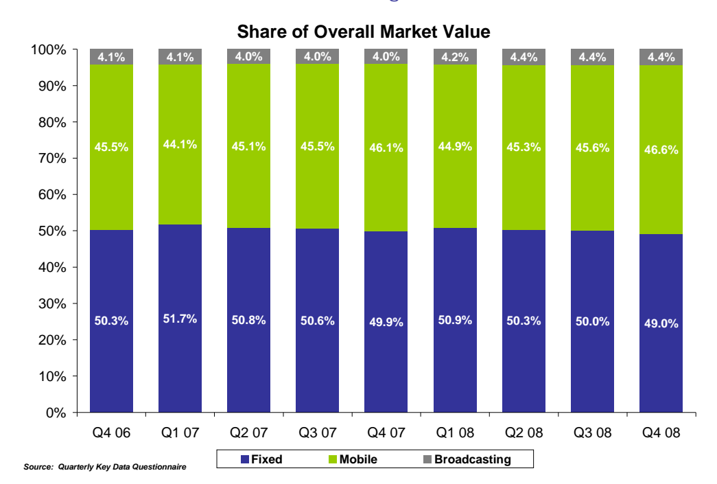
Figure 1.1.1 – Fixed, Mobile & Broadcasting as a % of Total Revenues

Data presented in Figure 1.1.1 replaces Figure 1.2.1 in ComReg 09/17. It examines the proportion of industry revenue attributable to the provision of fixed line, mobile and cable broadcasting services. It has been updated as the revised revenues provided by Vodafone have had the effect of increasing the mobile share of total revenues.