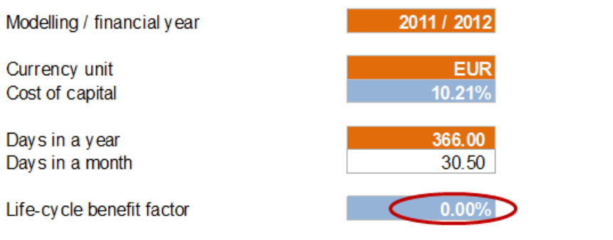
Table 18. An extract from the parameters of the Area Model

eir explains that in order to estimate the benefit related to uneconomic areas the Area Model is run two times: with the life-cycle mark-up benefit parameter equal to 0% and to \Join . The difference between two results corresponds to the life cycle benefit. TERA has checked how the results of the Area Model change with the change of the parameter (see table below).