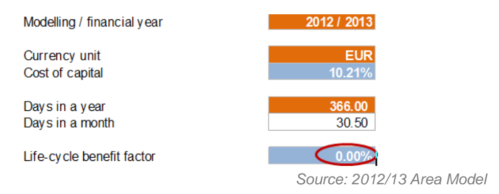
Table 18. An extract from the parameters of the Area Model

TERA confirms that the direct net cost of uneconomic areas is equal to \leq 268,296 when the parameter is set to zero and to \leq 259,518 when the parameter is set to \geq (see table below). The numbers used as inputs for the calculation of life cycle benefits relating to uneconomic areas are therefore correct.