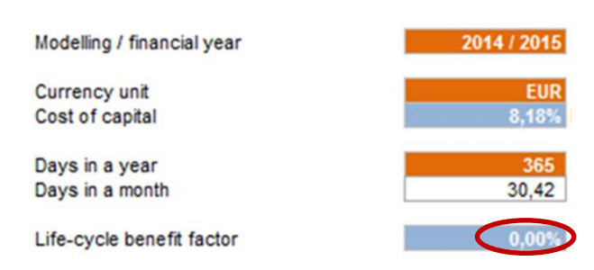
Table 19. An extract from the parameters of the Area Model

eir explains that in order to estimate the benefit related to uneconomic areas the Area Model is run two times: with the life-cycle mark-up benefit parameter equal to 0% and to . The difference between two results corresponds to the life cycle benefit. TERA has checked how the results of the Area Model change with the change of the parameter (see Table 18 below).